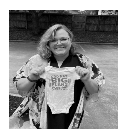
This lady created awesome messages on onesies for us