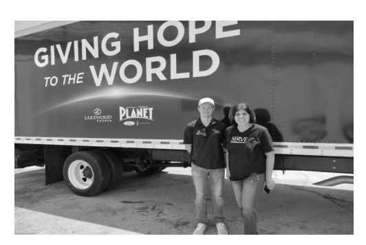
Receiving items from Lakewood Church (not the whole truck)