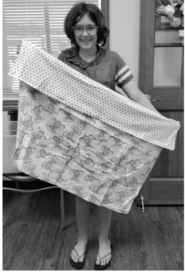
Young lady sewing blankets for us