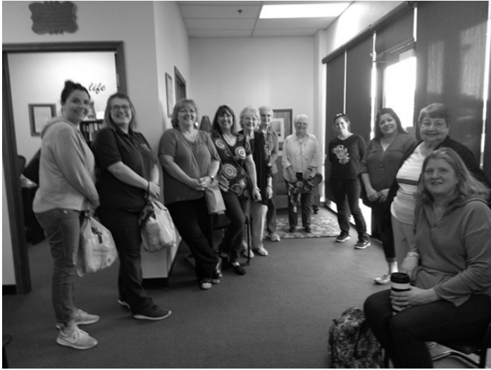
A group of ladies from Lamb of God toured our offices