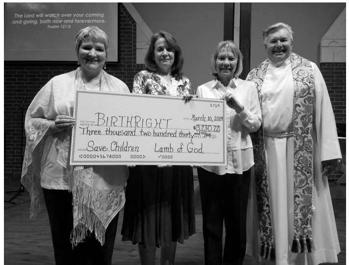
Lamb of God Lutheran Church donated a check from their collection