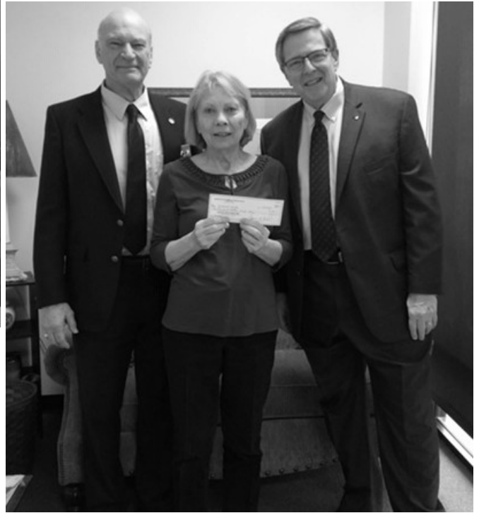
Knights of Columbus #9794 gave us a check from their chili cook off