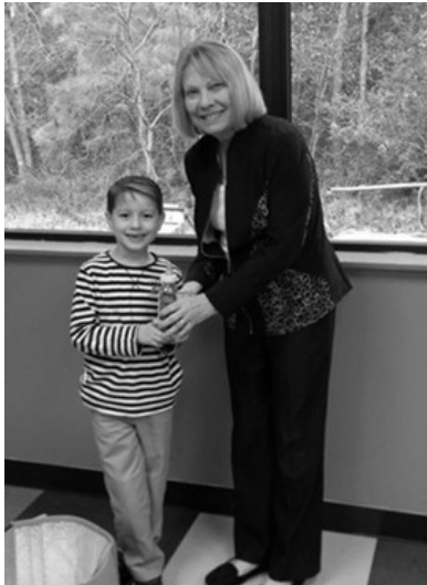
Even children collect coins for our annual fundraiser