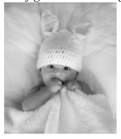
Children are not a distraction from more important work, they are the most important work.

Together, we can bring the darkness of the abortion industry into the light—to fight it and to bring attention to the sanctity of all human life.