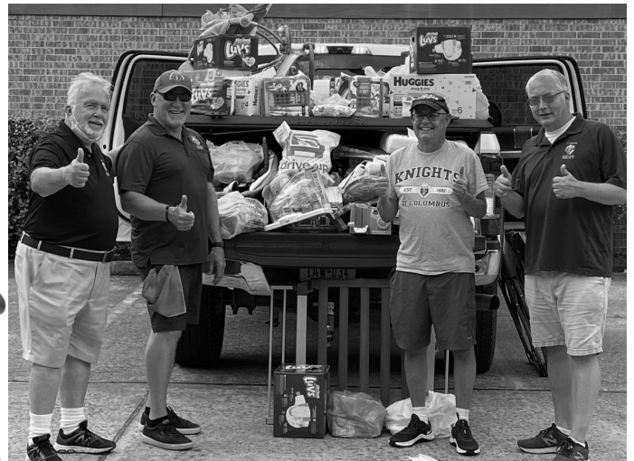
Knights of Columbus Council 12320 and their Mother's Day Collection. Wow! A truck load of wonderful items.