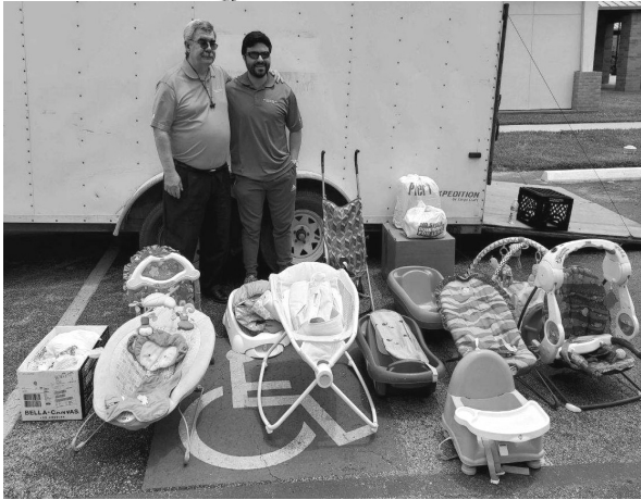
We had a wonderful donation from St. Mary and St. Martha's for Mother's Day, it was perfect timing as donations had been low. Thank you to all who gave!