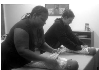
Learning to swaddle - baby dolls make willing participants!

weekly class taught in Spanish which has been requested amongst many of our clients. Recently, we've seen the need to adjust our classes for the many young