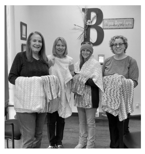
Above: Lamb of God Lutheran church donated crocheted blankets.

Below: Lamb of God Lutheran gifted with a check from their baby bottle boomerang.