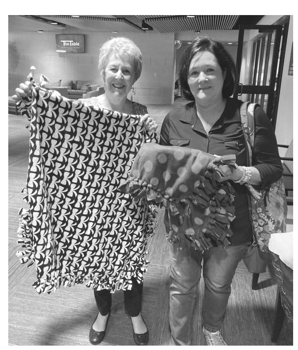
Blankets donated by the ladies bible study at Kingwood Methodist Church